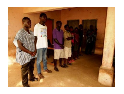
New Leadership for Hlefi and Aflao YMCAs